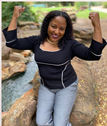
Former Client, Entrepreneur, Author