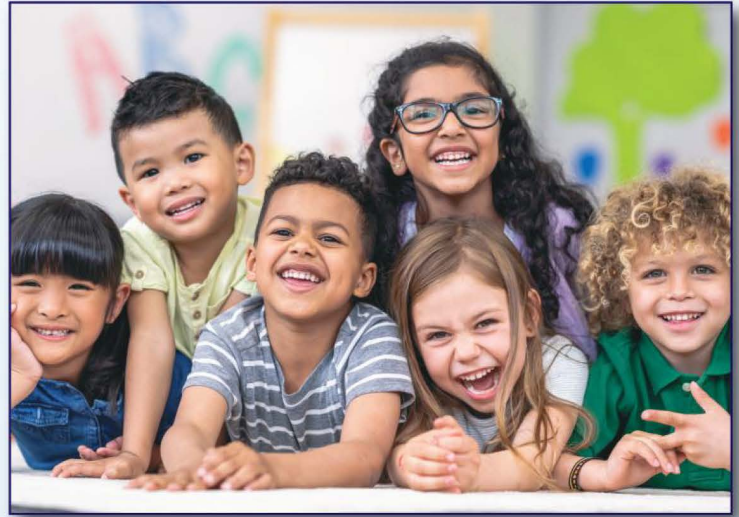
1. Beyond ABC, 2021-2022 Assessing The Well-Being of Children in North Texas , Children's Health SM 2. Frisco ISD

TOGETHER, we prevented hunger by providing for more than 582,000 meals right here in Frisco and Frisco ISD.