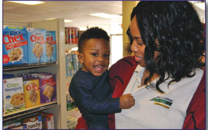
The FFS Market permits eligible clients to use their existing financial resources on other expenses without sacrificing putting food on the table.

A game or movie is also included to encourage quality family time together.